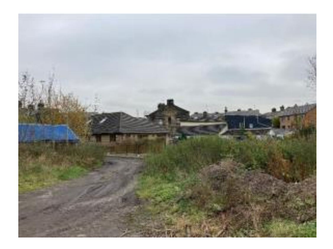
Photo 7: Retaining structure on the northern boundary to Shire Croft properties.